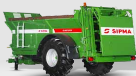
SIPMA RO 800 TAJFUN