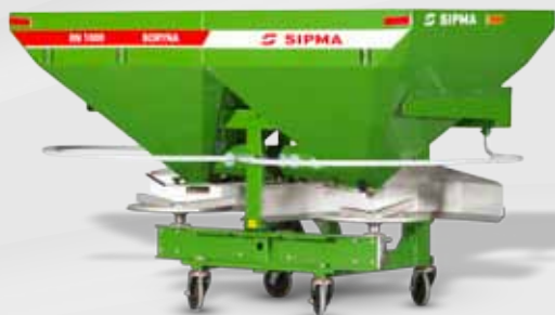
SIPMA RN 1000 BORYNA

SIPMA has a modern sowing hall where, with the help of advanced electronic equipment, sowing tables are prepared for all types of mineral fertilizer distributors on the market. SIPMA has focused the technological development on plant nutrition optimization. SIPMA offers a fertiliser spreading program that conforms to any European standards concerning accurate spreading and border spreading.