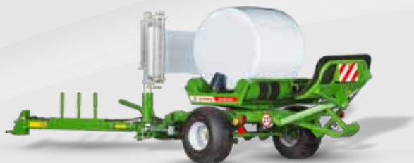
SIPMA OS 7650 GAJA

Technology of hay silage processing into filmwrapped round bales ensures the highest quality of fodder.