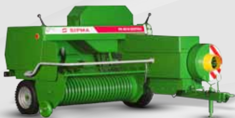
SIPMA PK 4010 KOSTKA

SIPMA PK 4000 KOSTKA and SIPMA PK 4010 KOSTKA cube balers are excellent straw collecting machines, also effective in collection of hay. The optimum design, excellent operating parameters, as well as high durability and reliability are the reasons why SIPMA S.A. has been manufacturing these machines for more than 30 years, continuously improving them. Almost 100,000 machines were sold to farmers so far.