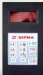
BALE WRAPPING COUNTER

allow to control the wrapper from the tractor cabin.