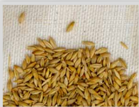
GRAIN BEFORE CRUSHING