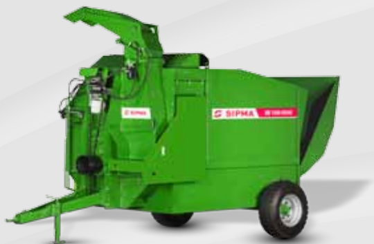
SIPMA RB 1500 KRUK

SIPMA RB 1200 KRUK and SIPMA RB 1500 KRUK are designed for shredding, feeding or spreading of hay, straw and hay silage in stables or open areas.