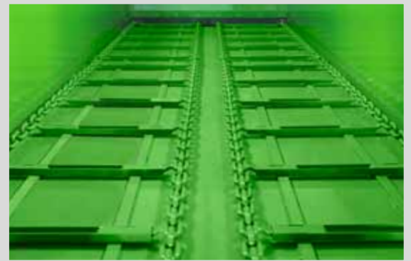
DOUBLE FLOOR CONVEYOR

● – standard, ○ – additional equipment, × – unavailable