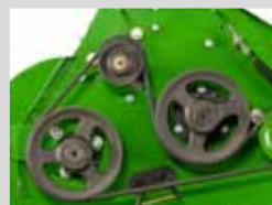
V-BELTS (ATLAS SERIES)