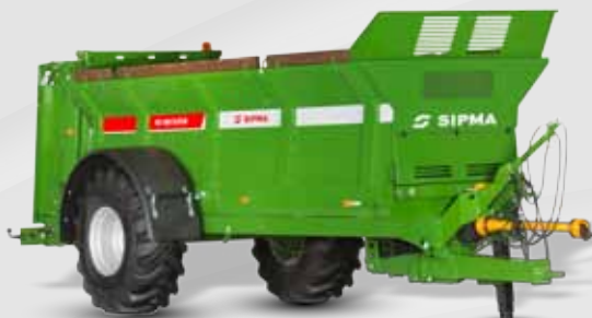
SIPMA RO 1000 TAJFUN