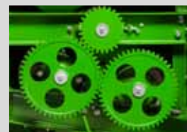
GEARS (TYTAN SERIES)