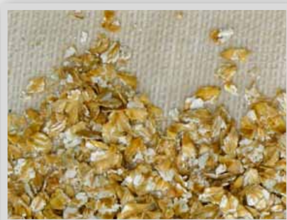
GRAIN AFTER THE USE OF SIPMA GRAIN CRUSHER