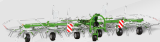
SIPMA PT 675 SALSA

Trailed tedders SIPMA PT 525 SALSA and SIPMA PT 675 SALSA are characterized by high efficiency. Machines guarantee optimal and equal spread of mowed material. Dedicated to work at small and medium farm with tractors with low power and low lifting capacity. Lowering the chassis to transport position is done by hydraulic cylinder.