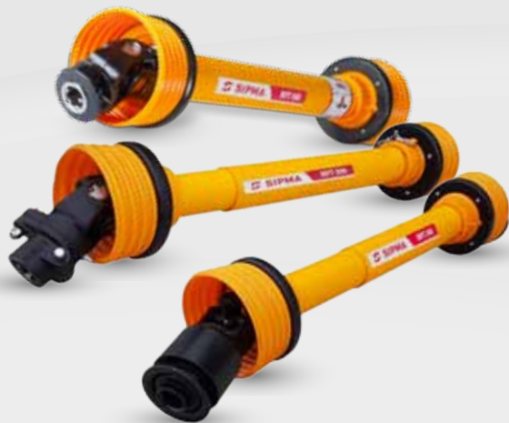
BASIC PTO SHAFTS

SIPMA WPTS 300 SIPMA WPTS 680 SIPMA WPTS 900 SIPMA WPTS 1200