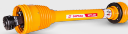
WIDE ANGLE PTO SHAFT

Wide angle PTO shafts are used in the case where the fracture of relative position of the tractor power take off to the machine power input connection shaft can allow reaching up to 50° angles in every working moment and 80° angles temporary. These shafts make it possible continuous power transmission without necessity disengaging the drive on headlands.