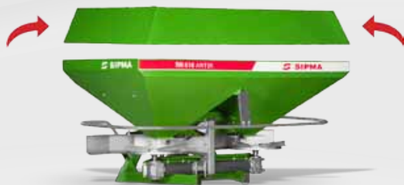
SIPMA RN 610 ANTEK WITH TOP UNIT

are mounted easily on the container and enable adjusting capacity depending on needs, thanks to which the distributor can be used both on small and large areas.