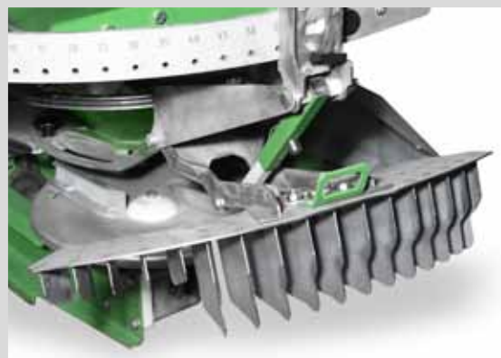
LIMES BORDER SPREADING SYSTEM

allows to work at the field boundaries in accordance with the fertilization regulations, while ensuring the delivery of the correct dose of fertilizer to the very border of the field. It also eliminates economic losses resulting from over-fertilization or from spreading fertilizer to adjacent fields.