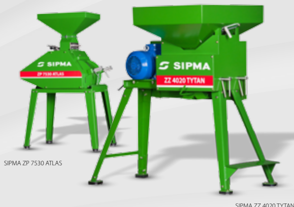
SIPMA ZP 7530 ATLAS

SIPMA ZZ 4020 TYTAN SIPMA ZZ 7520 TYTAN SIPMA ZZ 7530 TYTAN